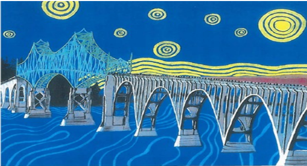
Art by VALENE WOLF